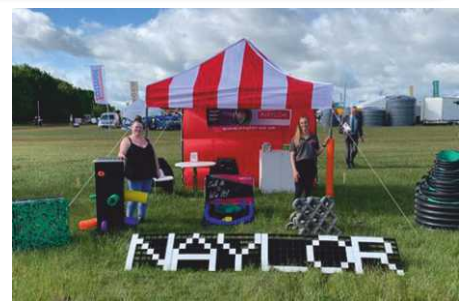
We exhibited at the Cereals show