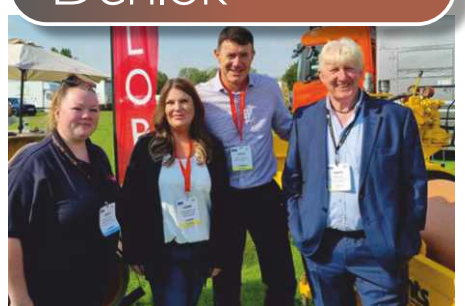
Denlok was exhibited at the Peterborough No-Dig exhibition