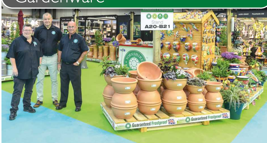
We again exhibited at Glee, the flagship trade show for our Gardenware business