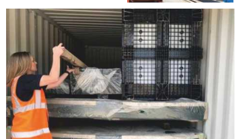
We exported a container of mesh fencing to St Lucia