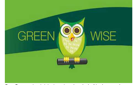
Our Greenwise initiative aimed to help Naylor employees minimise their carbon footprint.