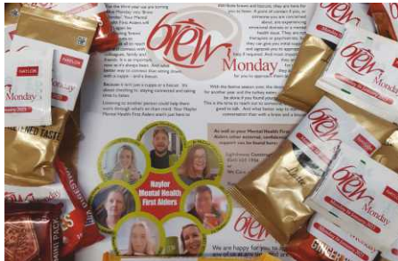
... as was Brew Monday in January- our 3rd year of participating