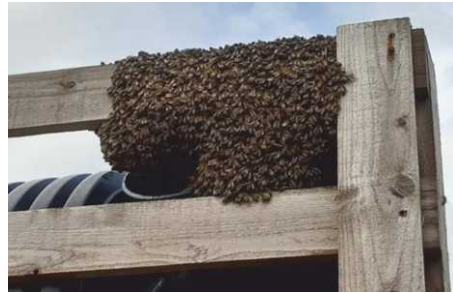
A swarm of bees on Cawthorne site needed professionally relocating...