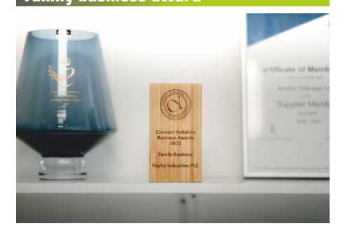
We won the "Family Business of the Year" Award in the prestigious Connect Yorkshire awards