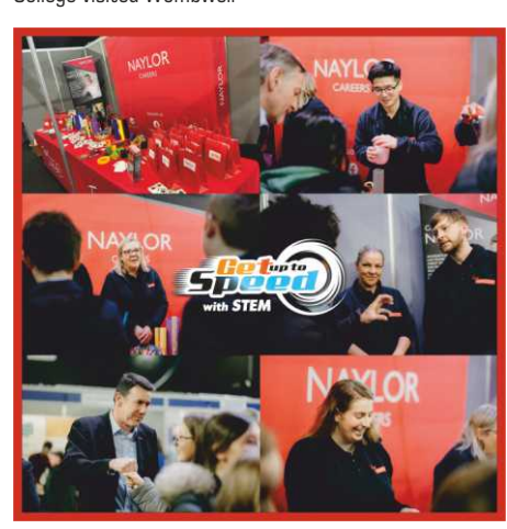
We again supported the Get Up To Speed (GUTS) careers fair \,