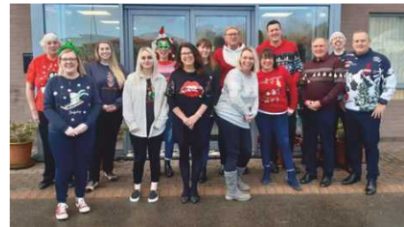
A rather motley collection of Xmas jerseys was on display across our sites raising money for local Hospices