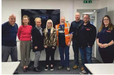
Excel training took place at Wombwell