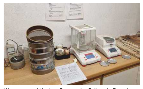
We supported Horizon Community College in Barnsley with work experience placements including raw material testing