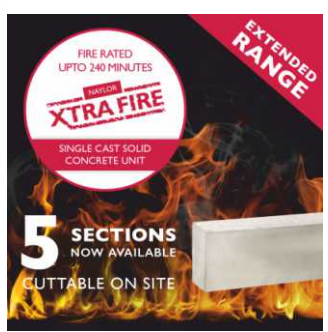
New product launch - XtraFire lintels. A single cast solid concrete unit