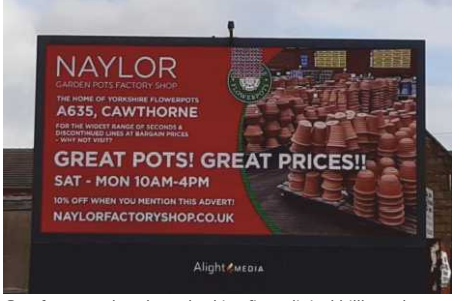
Our factory shop launched its first digital billboard advert