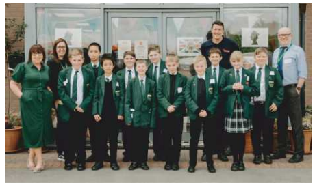
The Year 7 STEM Club of Barnsley's Horizon Community College visited Wombwell