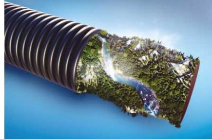
MetroDuct Class 1 ducting facilitating the use of renewable energy e.g. solar, wind, EV etc