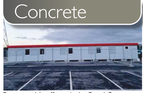
Our new modular office arrived at Barugh Green