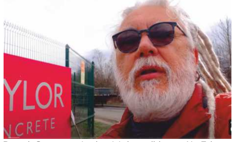
Barugh Green received a visit by well-known YouTuber, PJ Audits

August social media activity focused on Yorkshire day.