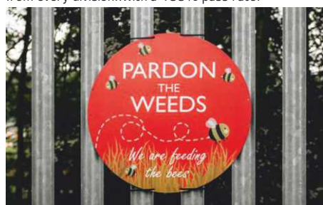
Wombwell took part in the national No Mow May campaign which encourages the growth of Spring wild flowers