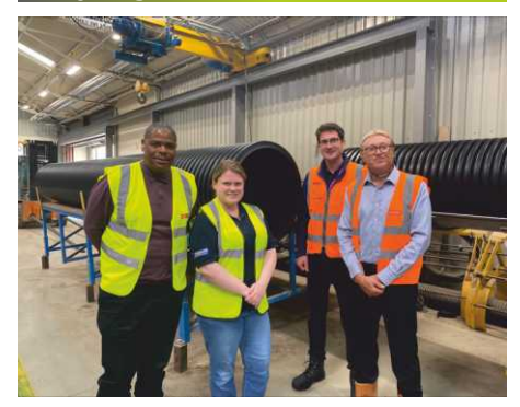
Naylor have been working with Anglian Water on converting scrap potable water pipes into MetroDrain IC