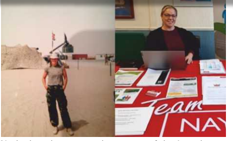
Naylor have been a proud supporter of the Armed Forces Covenant since March 2021