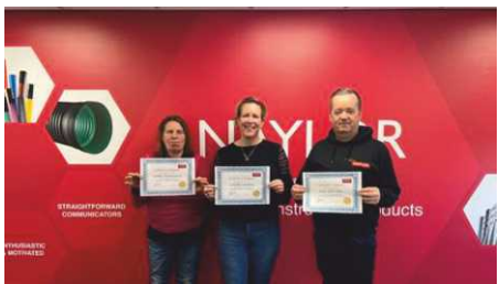
Investigations training at Cawthorne