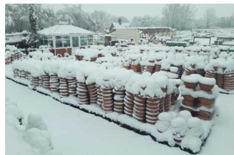
March saw some snow-related disruption at Cawthorne